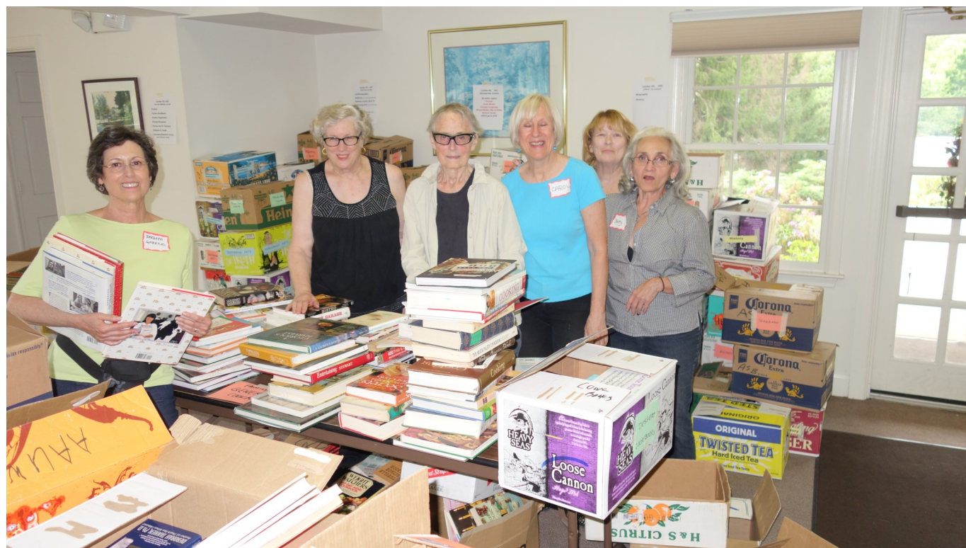
Volunteers enjoy sorting cook books during our August Sorting Days.