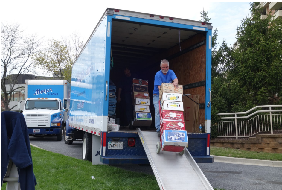
Two vans of books being delivered

The funds raised by the book sale support college scholarships for female students both at the graduate and undergraduate level, scholarships for local women to attend the National Conference for College Women Student Leaders (NCCWSL) held in College Park, and the AAUW Legal Advocacy Fund. Last year we raised over $15,000 for these activities. At our September meeting we enjoyed meeting this year's seven local scholarship recipients and hearing their stories. What an impressive group of women they are! We hope to help more deserving students in 2015.