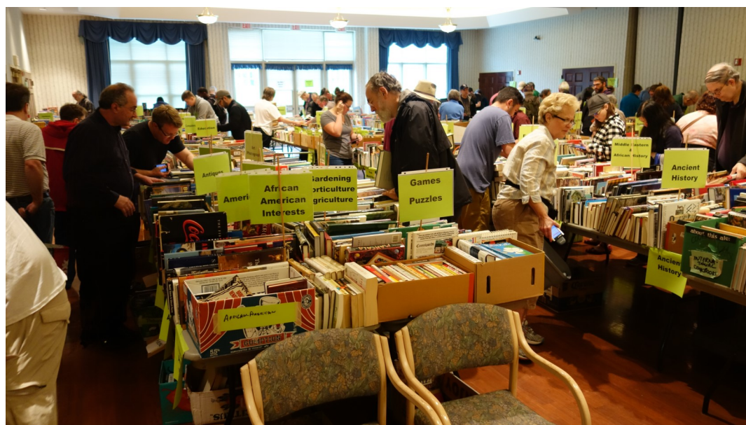
Thursday morning throng at the book sale

A big thanks to everyone who helped at the book sale and during the year. Also, we sincerely appreciate our partners whose support was essential. These include Asbury Methodist Village, who provided space and on-site support; Gaithersburg Storehouse, who supplied storage space during the year; the Montgomery County Department of Environmental Protection, who provided access to recycled books; the Montgomery County Volunteer Center, who provide a system to recruit volunteers; and the Montgomery County Public Schools, who publicize our need for student volunteers.