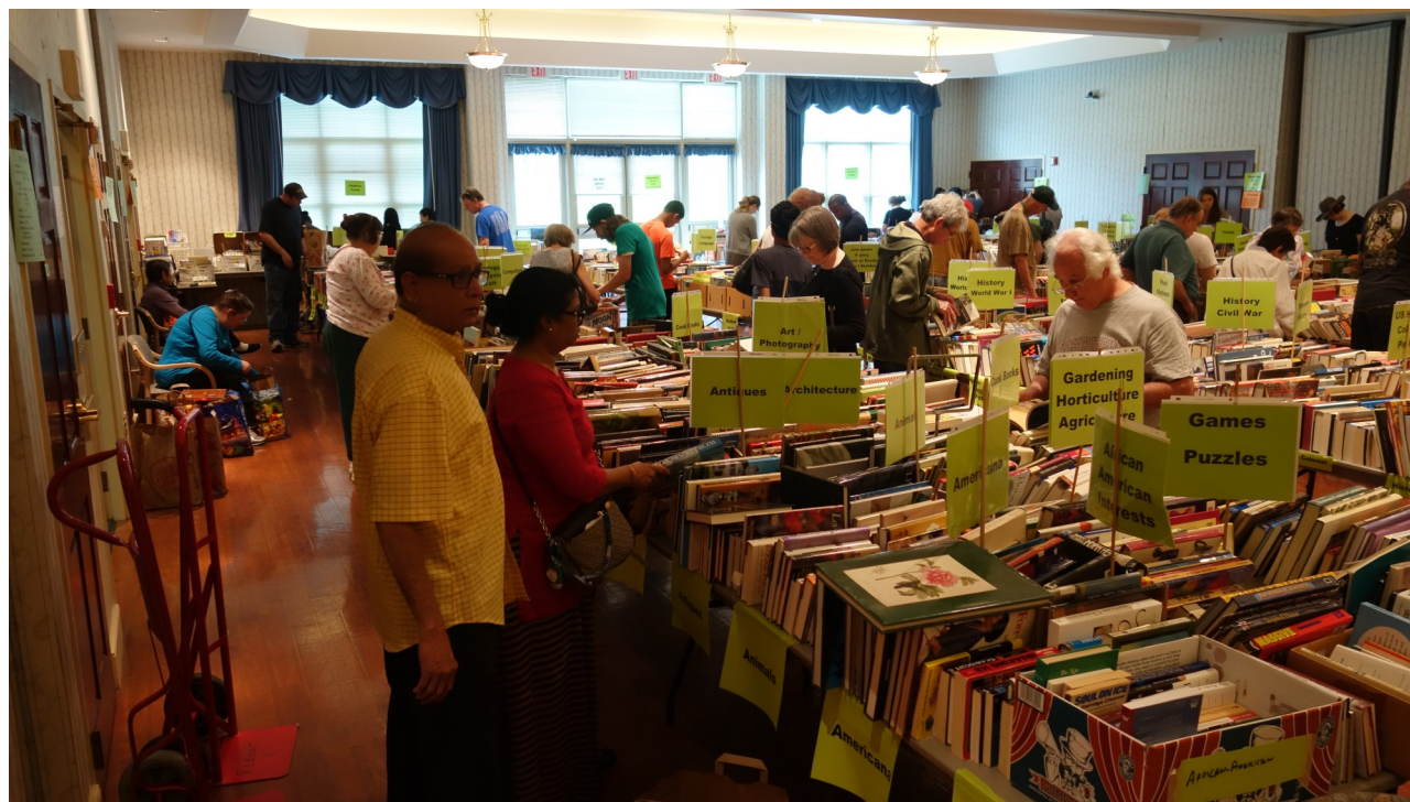
A sample of happy shoppers at a past book sale. Proceeds of our book sales go to scholarships for women.

We welcome your help and new ideas you may have. You may send Liz Hessel an email at liz[at]meral[dot]com or give her a call at 301-840-1258.